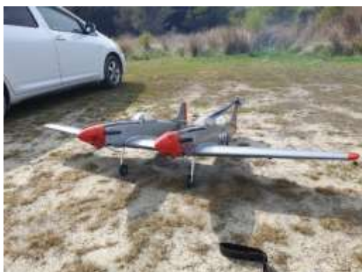
Seeing double with Peters new North American F-82 Twin Mustang