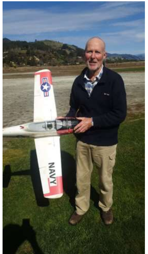
The treasurer secures his wings badge