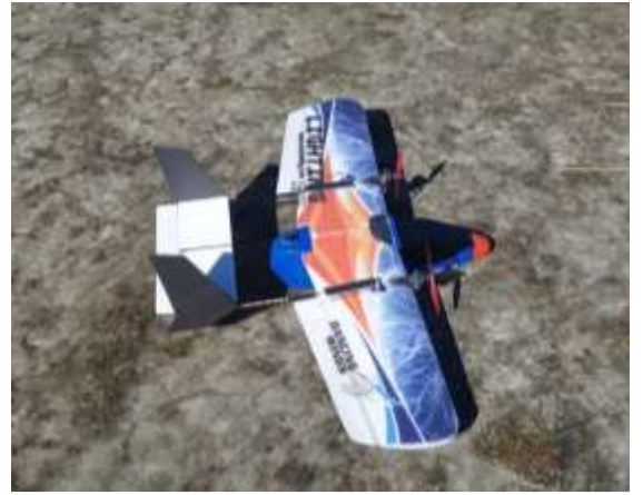
Phil's latest creation