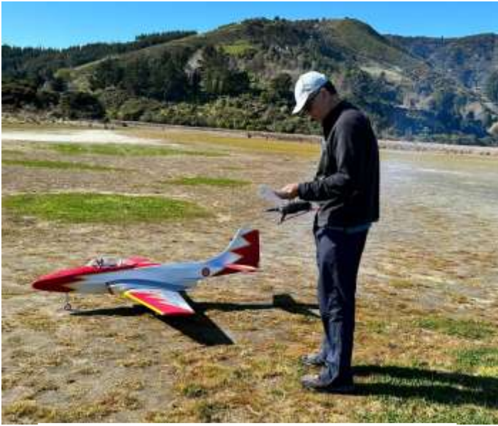
Murray refers to page 465 of the Aircraft flight manual