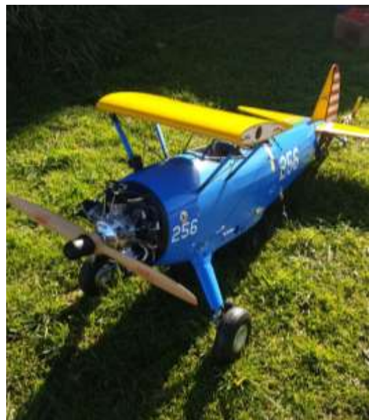
Wayne runs up the Stearman's 5 Cylinder Radial