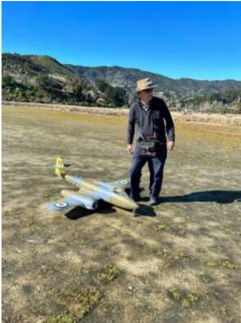
Murray checking the runway is clear for take-off with the twin EDF Gloster Meteor.