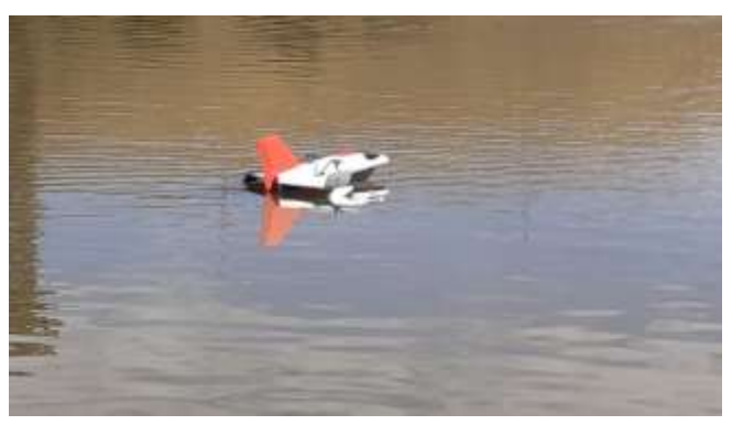
Philip's maiden voyage and flight of the Twin Seajet at the ponds