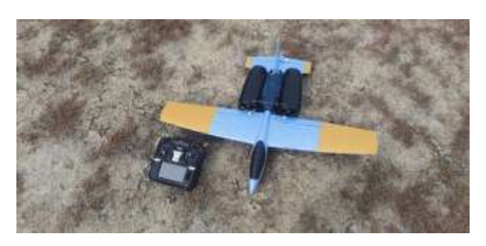
Dans Kmart Glider dual EDF conversion