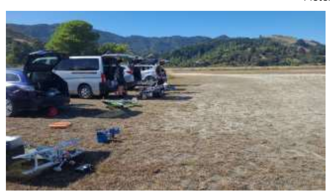
Activity in the pits on Sunday as we kick into another good year of flying.