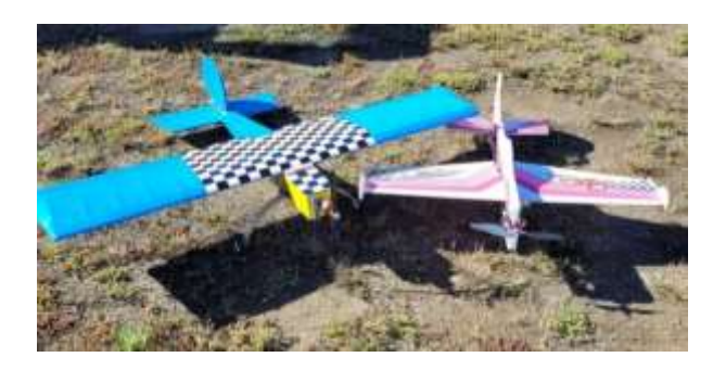
Gregs new Christmas toys