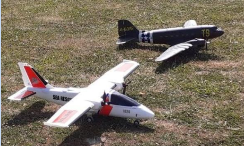
Part of Phil's fleet