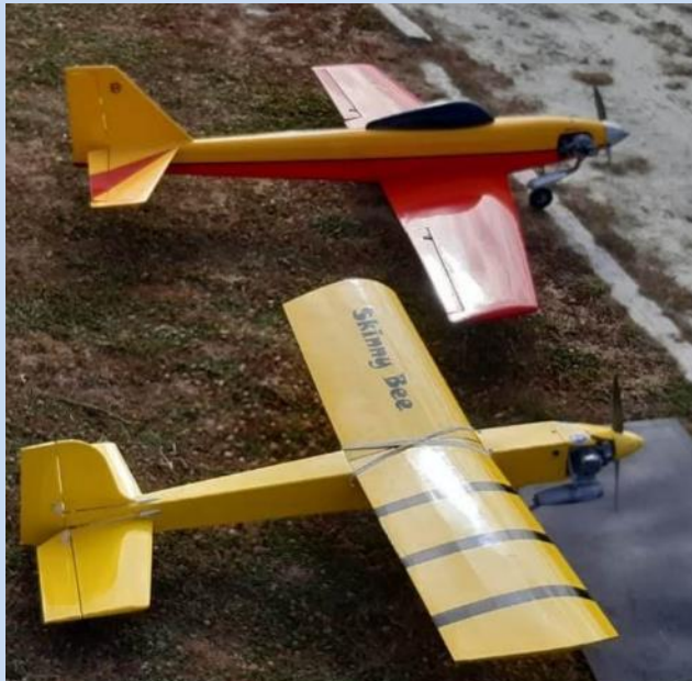
and Dave's fleet