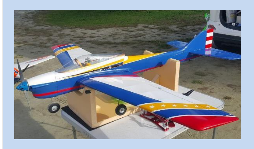
Murrays Typhoon – a "modern classic" (electric powered)