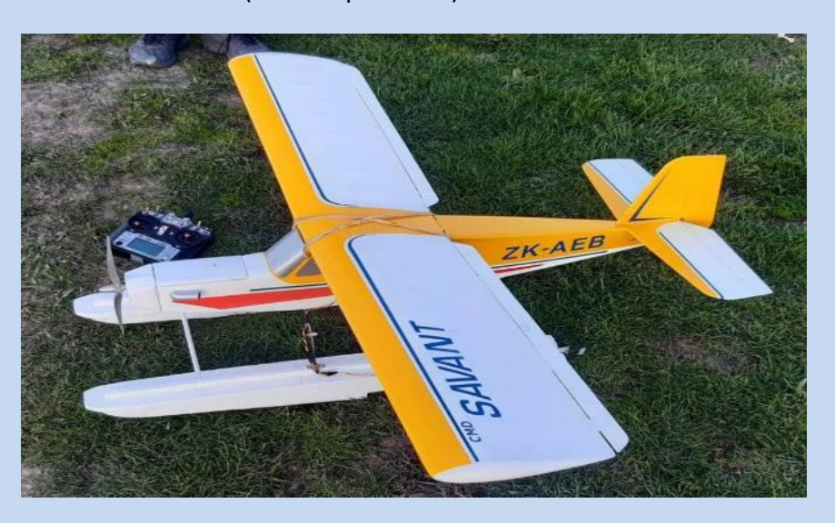
Mike's new float plane – also earlier pictured flying at Nile Road.