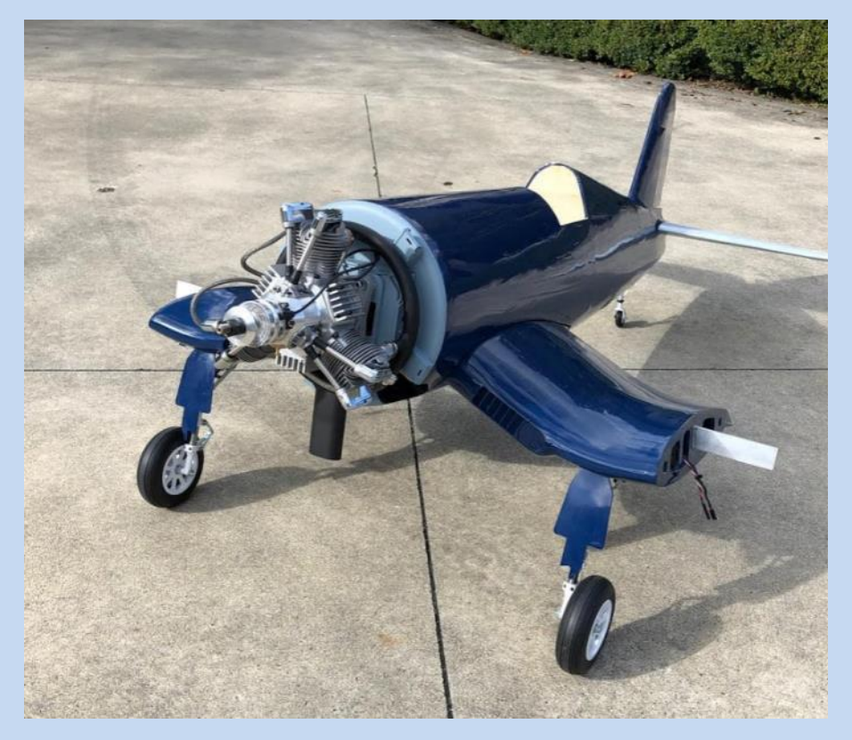
Grant's Corsair – we are awaiting reports from the upcoming maiden flight.