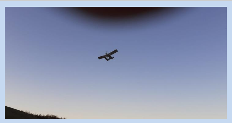
Float flying at Nile Road