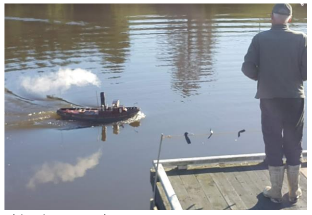
The rescue boat in action (thanks Duncan)..