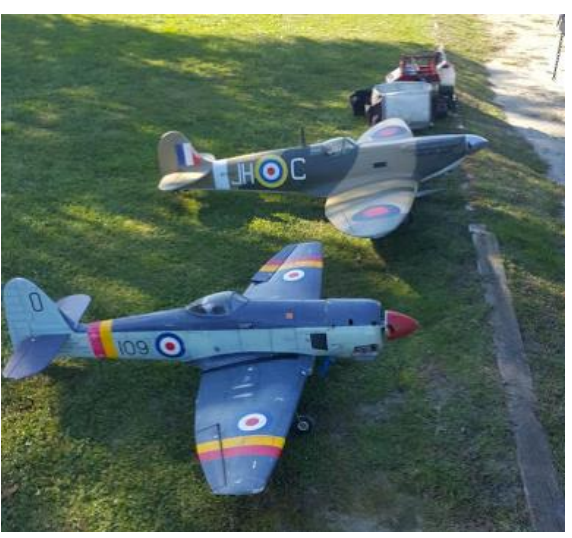
Sea Fury and Spifire.