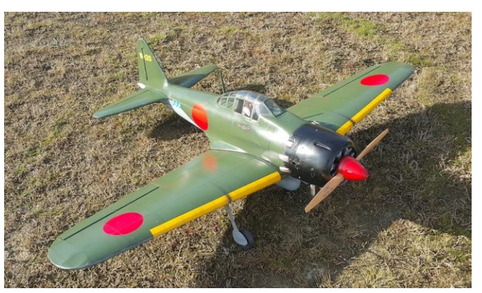
Pete's new Zero.