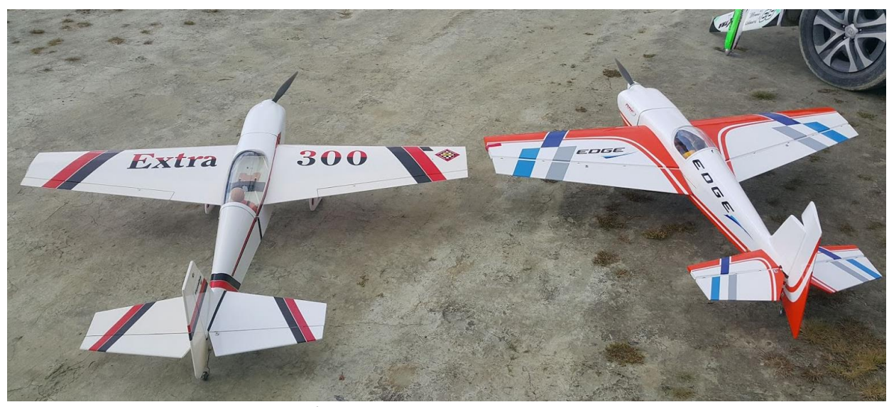
Murray's IMAC team; Extra 300 and Edge 540.