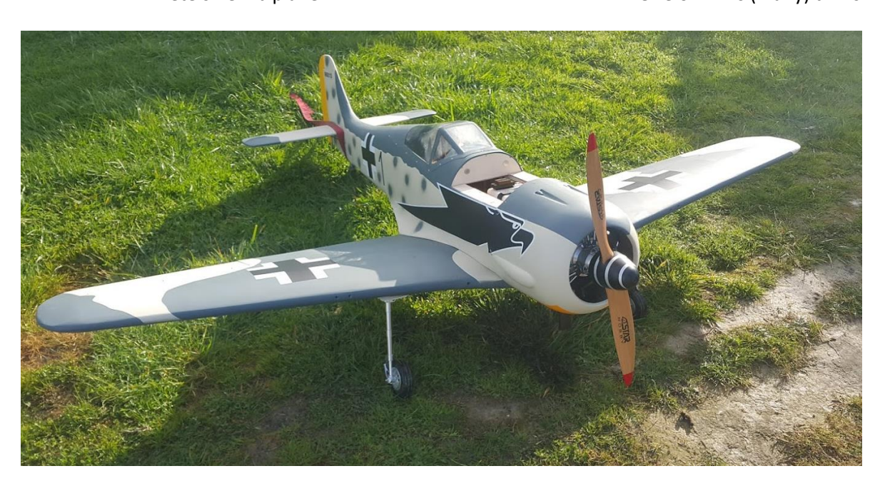
Wayne's FW190. A close up of the triple cylinder engine (below).