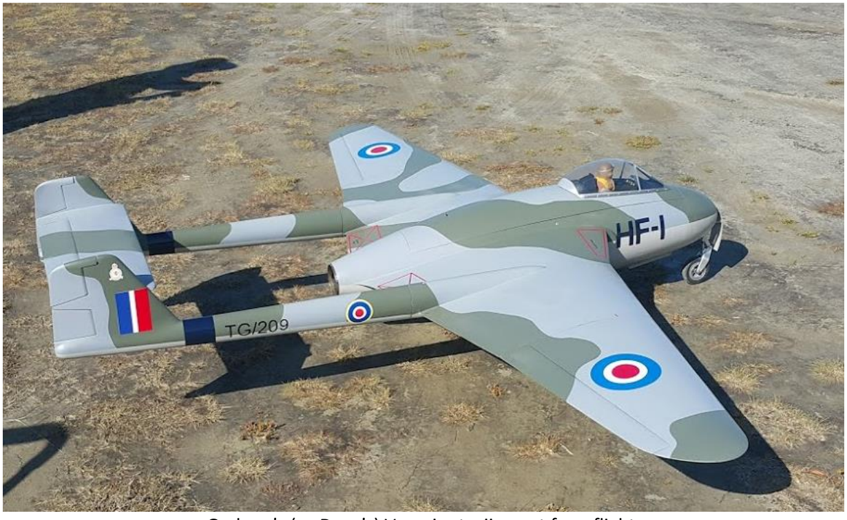
Graham's (ex Dave's) Vampire taxiing out for a flight.