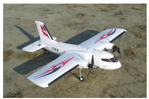
One of Phil's (many) twins.